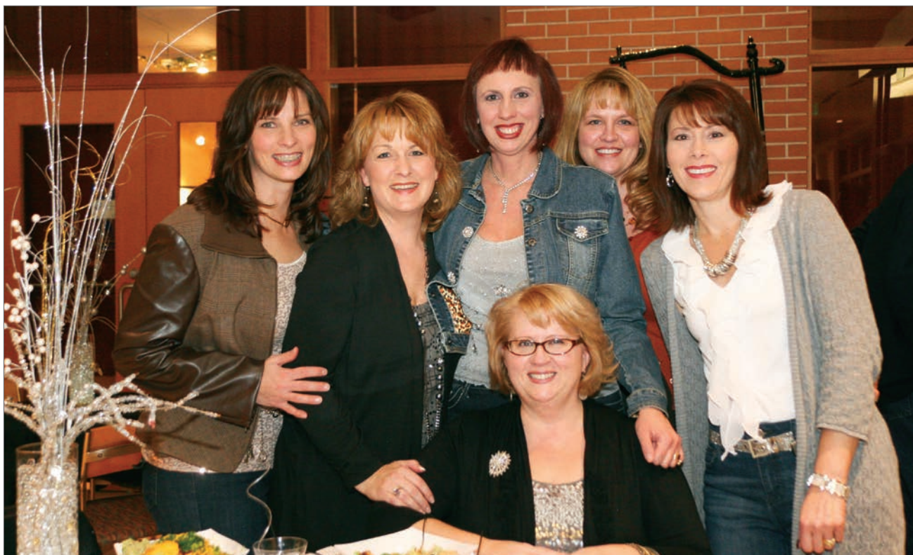
Girls Night Out at Blue Jeans, Bangles & Bling: RAM's Sparkling 8th Anniversary Celebration