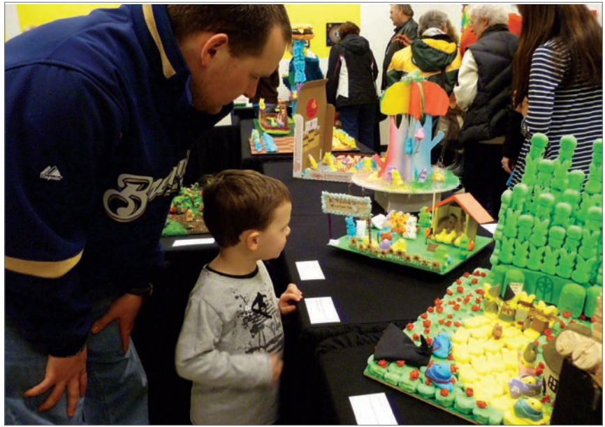
Second Annual International PEEPS® Competition