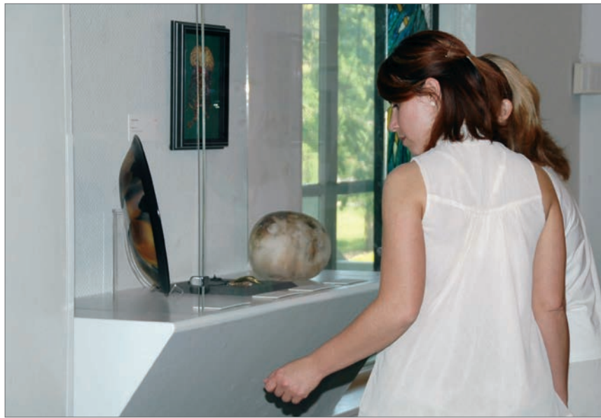
Racine and Vicinity Show at RAM's Wustum Museum