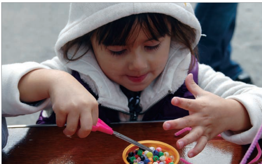
Free Family Hands-on Art Event