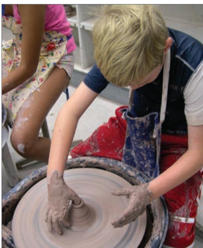
Kids' Art Class at RAM's Wustum Museum