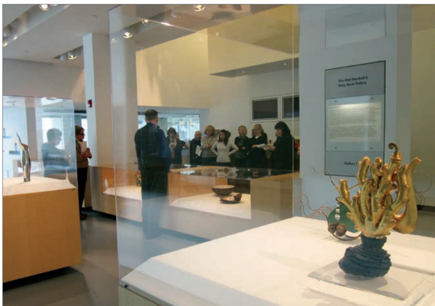
Docent and Staff Training for Not So Still life