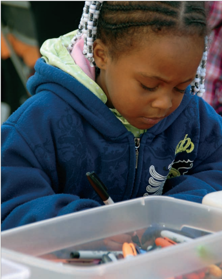
Free Hands-On Family Art Event