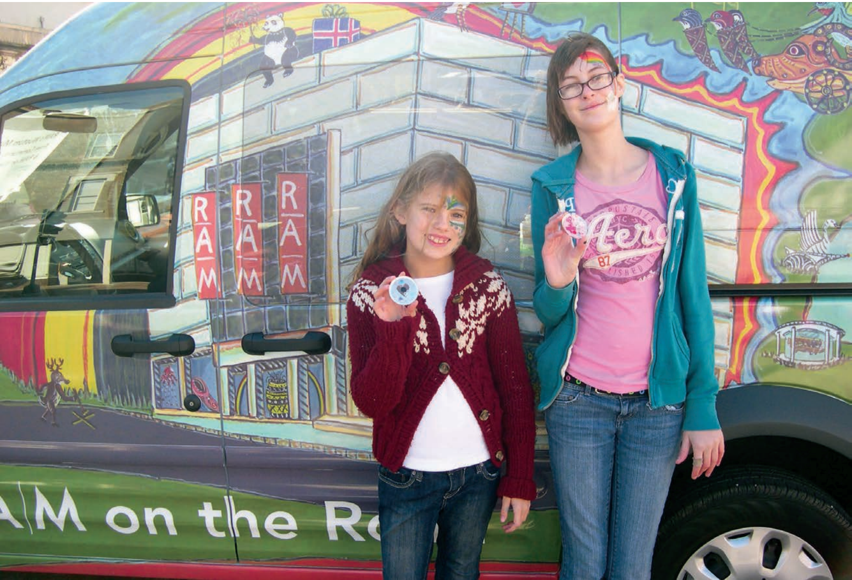
RAM on the Road at Party on the Pavement