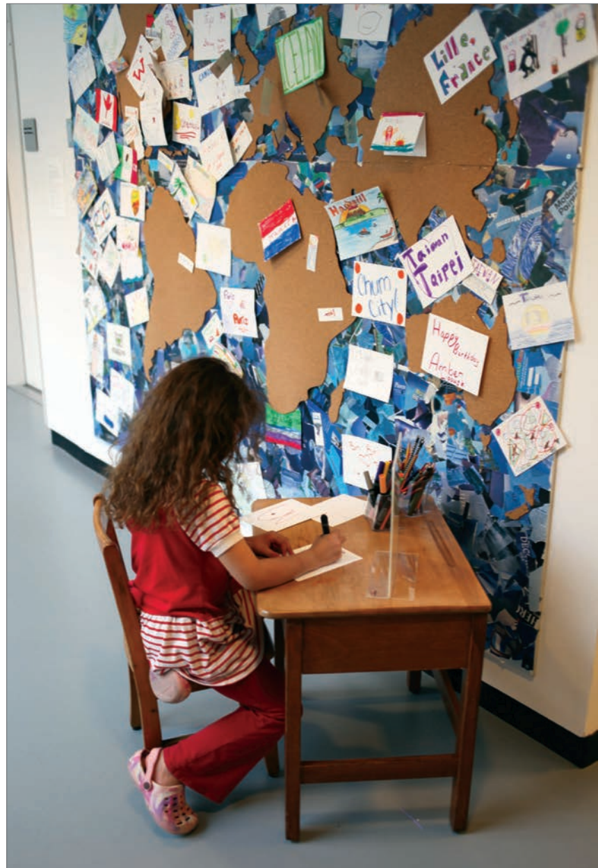
Free First Friday at RAM