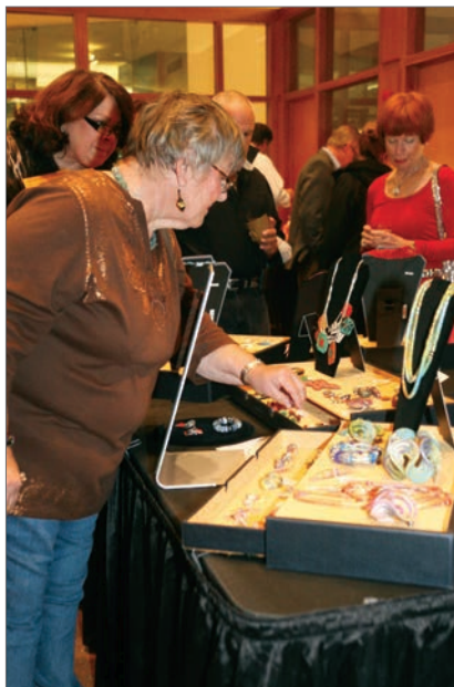
Blue Jeans, Bangles & Bling: RAM's Sparkling 8th Anniversary Celebration