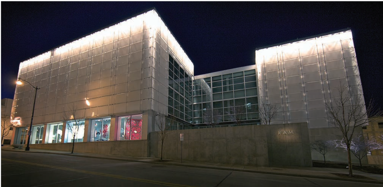
Racine Art Museum