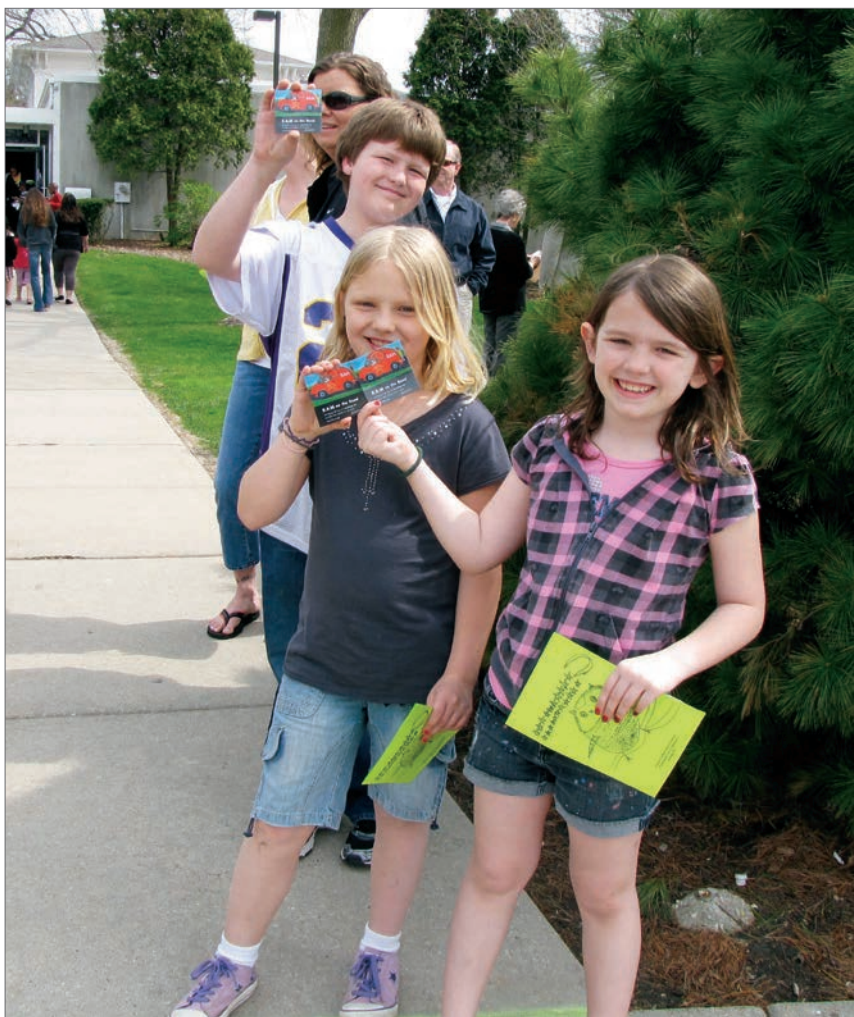
RAM on the Road Reveal at RAM's Wustum Museum