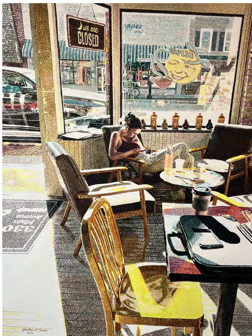
Heather Trost Open Door , 2025 Watercolor

Jeff Kosmala Racine Early Morning Light , 2025 $300 Acrylic