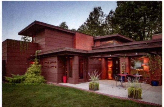
Still Bend is located less than 2 miles from the shores of Lake Michigan, near Point Beach State Forest.

Aesthetically, the home evokes the promise