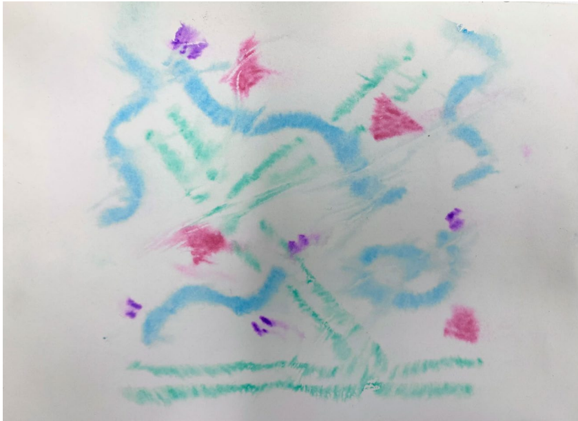
Project Sample and Photography: Emma Vanderwall

Take inspiration from the many printmakers participating in Wustum's annual Full Steam Ahead event to make your own monoprint at home!