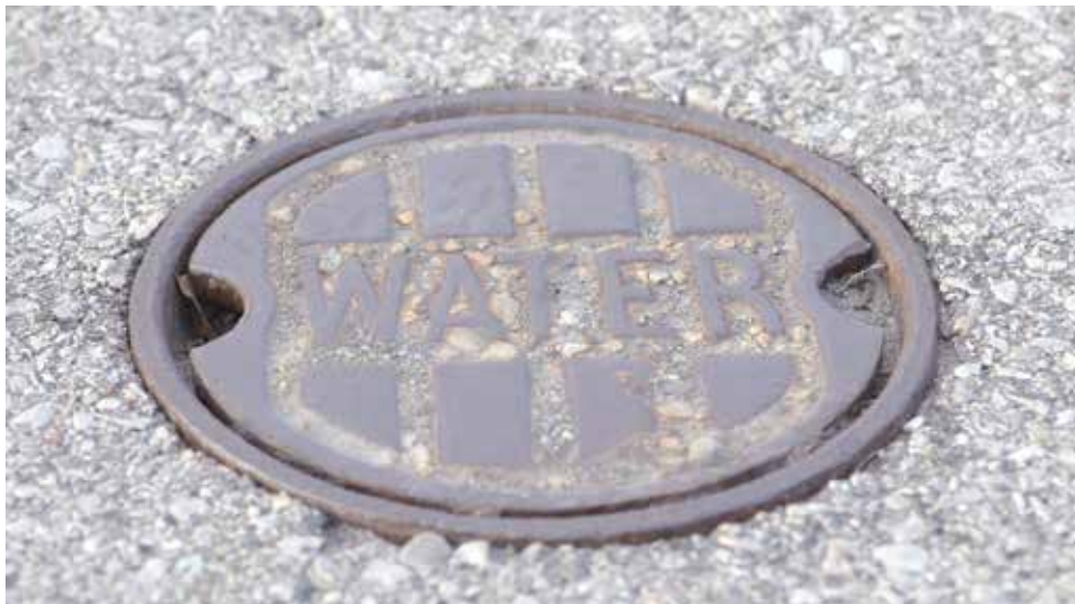
(above) Jojin Van Winkle co-rising , 2023 Still from digital HD video and Super 8 film transfer, 16:9 7:00 minute duration