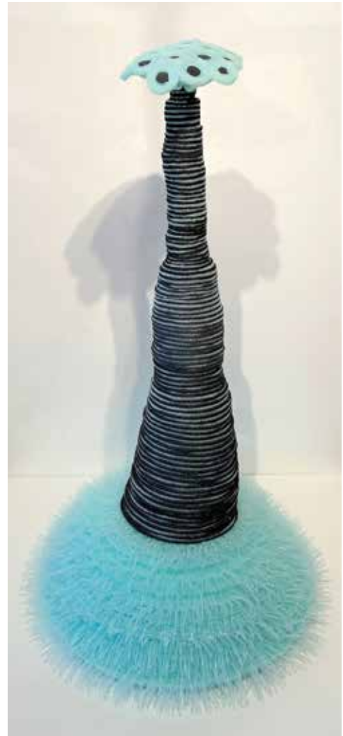
(right) Maureen Fritchen Untitled in Aqua and Black , 2023 Polyethylene foam 48 x 30 inches