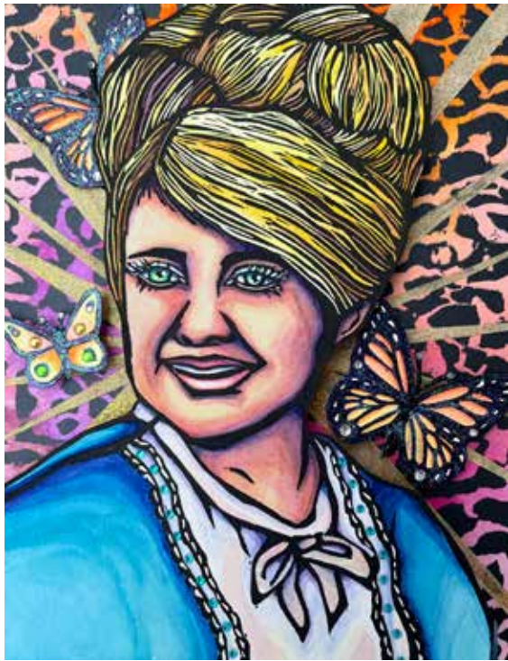
(bottom) Kelly Witte For Tomorrow May Rain So I'll Follow the Sun, 2023 Linocut, silkscreen, watercolor, acrylic ink, glitter, and rhinestones on paper 9 3/4 x 7 1/4 x 1/2 inches