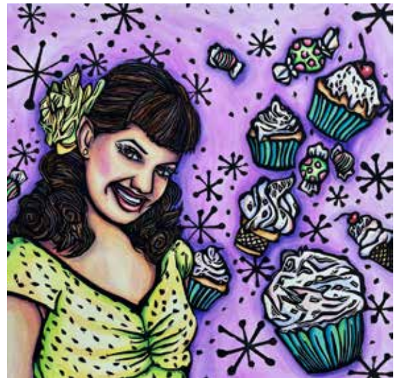
(top) Kelly Witte Sweet Deceit , 2023 Watercolor on linocut 12 x 12 inches

Through my suite of prints, I am able to combine my favored media with my love of vintage attire.