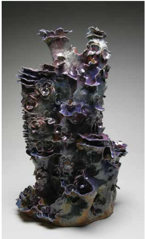
Peter F. Aymonin Mercury, Azrael , 2023 Glazed porcelain 18 x 12 inches Collection of the Artist