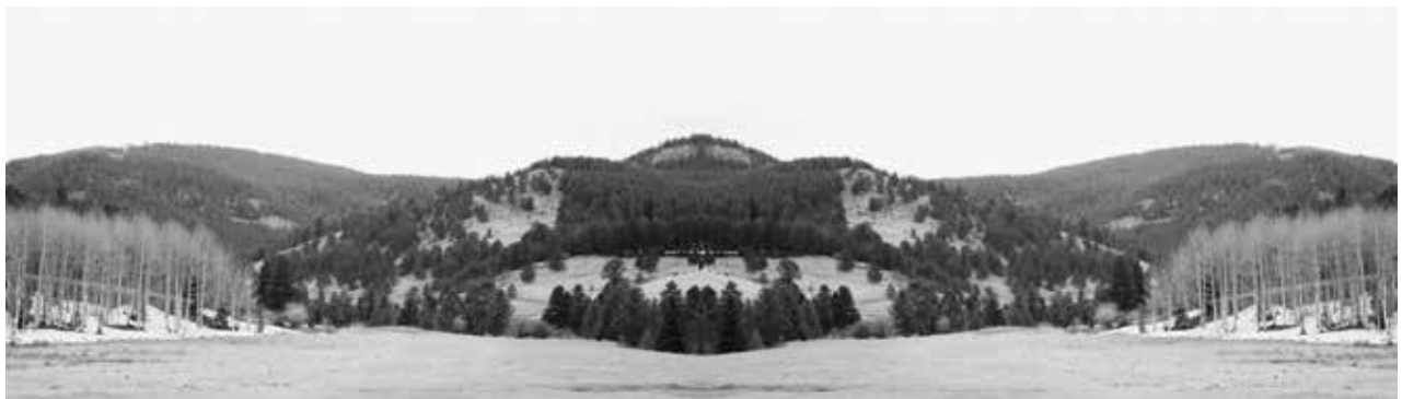
(below) Jojin Van Winkle karuna meditations 4 , 2023 Still from digital HD video shot on iPhone, 32:9 4:00 minute duration