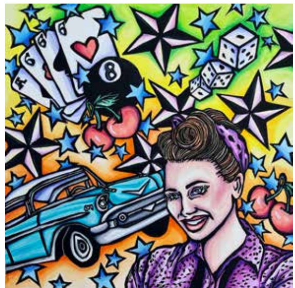
(bottom) Kelly Witte I'd Rather Laugh With the Sinners Than Cry With the Saints , 2023 Linocut and watercolor on paper 12 x 12 inches