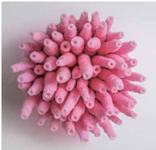
(left, bottom) Maureen Fritchen Beloved [Tubes in Pink] , 2021 Polyethylene foam and salvaged MDF board 20 x 12 inches