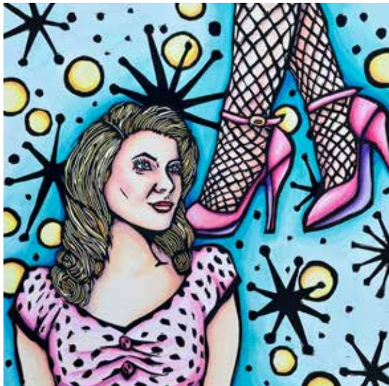
(top) Kelly Witte All Dressed Up With Nowhere to Go, 2023 Linocut and watercolor on paper 12 x 12 inches