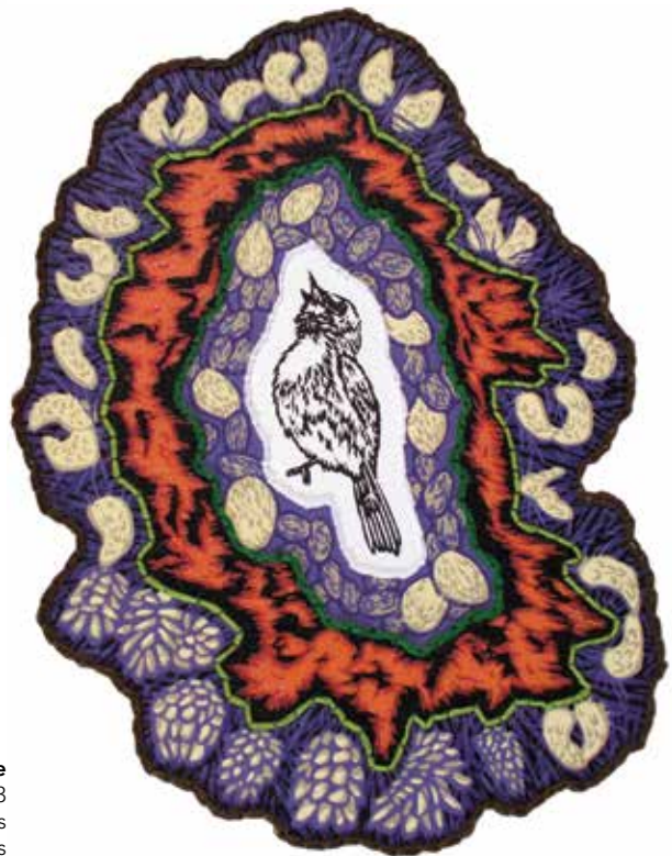
Lisa Bigalke Kirtland's Warbler Rises from the Ashes , 2023 Reduction relief and embroidery floss 12 x 12 inches