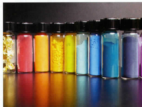
Chemistry of Color .

For more information: 317.923.1331, IMAMuseum.org/Exhibition/Chemistry-Color .