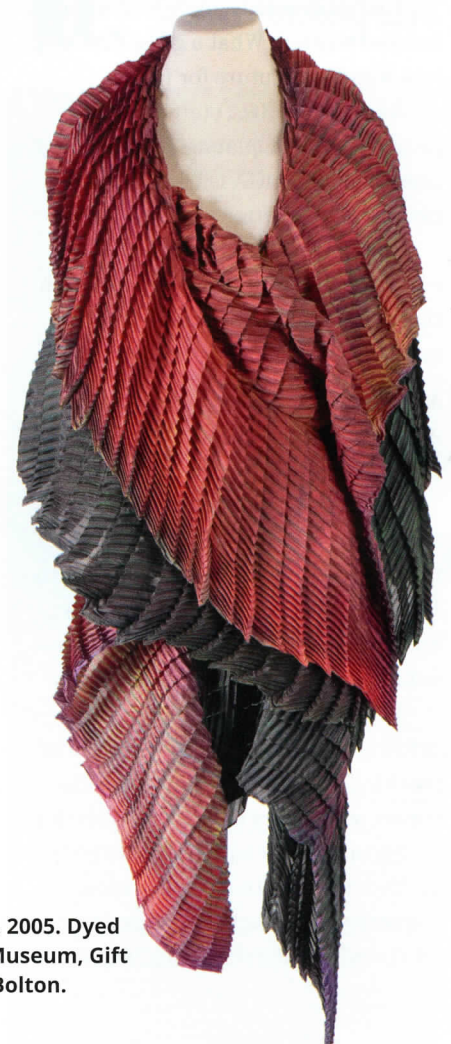
Karren K. Brito, Opera Shawl , ca. 2005. Dyed silk, 41 x 18 inches. Racine Art Museum, Gift of Laurie Waters.