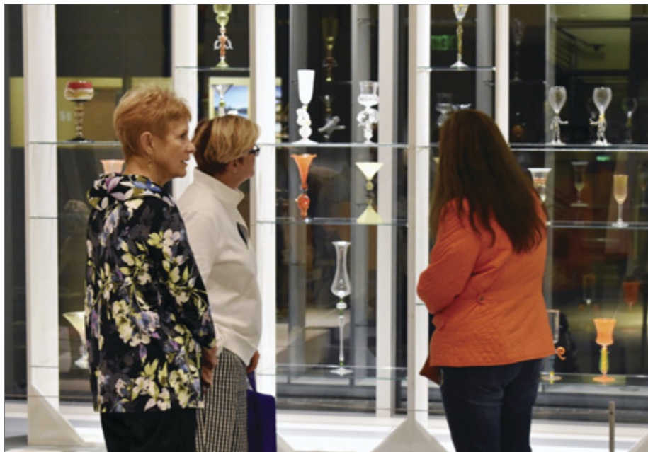
(left) In the RAM Galleries (above right) Free Hand-on Art at RAM (right) Studio Art Class at Wustum