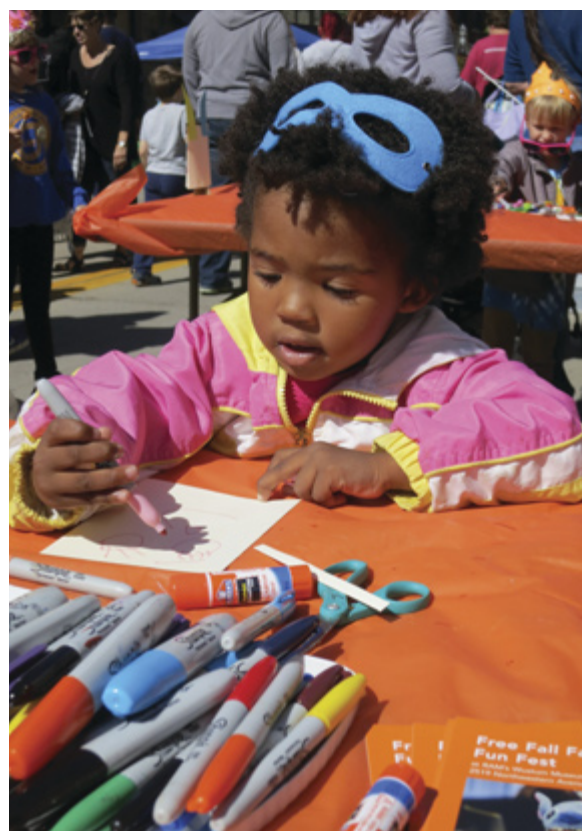
Fall Family Fun Fest at Wustum