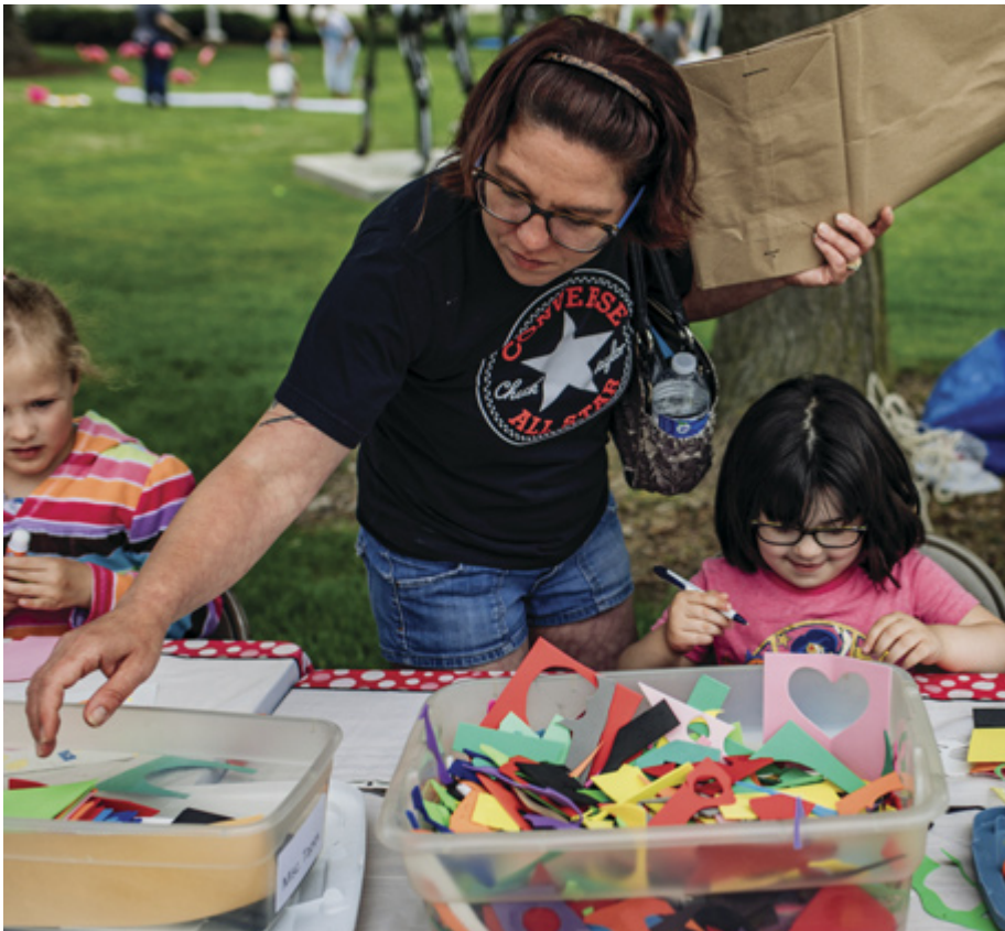
Kids Day at Wustum