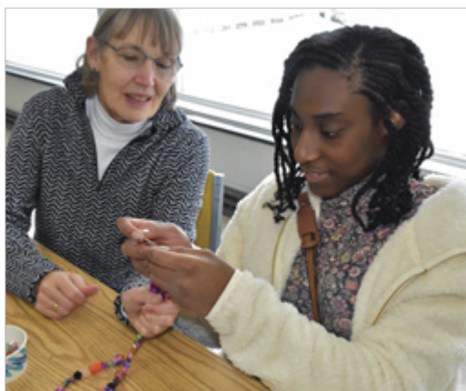
(bottom) Big Sisters Little Sisters Event at Wustum