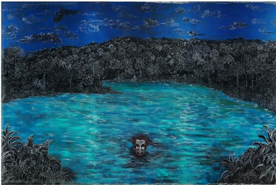
Edouard Duval-Carrié Lost at Sea , 2014 Acrylic, glitter, and resin on aluminum panels 94 x 144 inches Art Bridges

Edouard Duval-Carrié's large scale two-dimensional work addresses the propaganda of paradise, responding to the way historical imagery sometimes diminished cultural identity. As a Haitian artist, Duval-Carrié's work often features elements of his culture and nature as well as surrealist imagery. The loan of Lost at Sea by Edouard Duval-Carrié to the museum represents a newly formed partnership between RAM and Art Bridges, a foundation dedicated to expanding access to American art across the nation. Create your own metal, surrealist painting inspired by the work of Edouard Duval-Carrié!