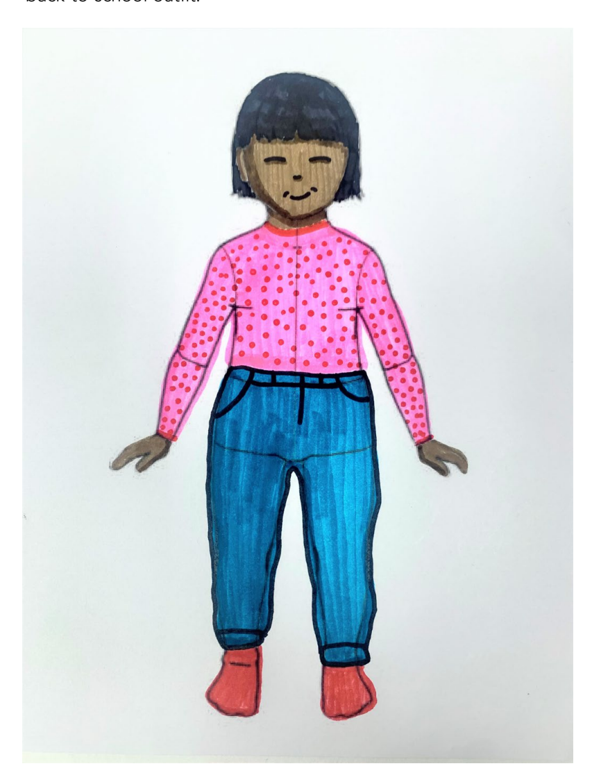
Project Sample and Photography: Emma Vanderwall

Summer may be ending, but don't let that ruin your spirits! Reactivate your creative thinking skills in time for the school year by designing your dream back-to-school outfit.