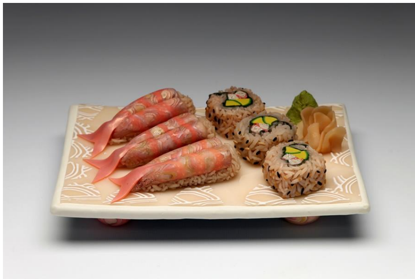
Lindly Haunani Sushi Platter , 1992 Polymer, powdered pigment, and metal leaf 2 1/2 x 8 1/2 x 5 1/4 inches Racine Art Museum, Gift of the Artist

Lindly Haunani is a founding member of the National Polymer Clay Guild. She is also the author of Color Inspirations and the producer of a series of DVDs entitled, Confident Color . Haunani's lively, vibrant, and sometimes, humorous work relies on color as a key design element. RAM's collection includes several of her polymer works, such as various neckpieces, a sushi platter, and an asparagus-themed adornment.