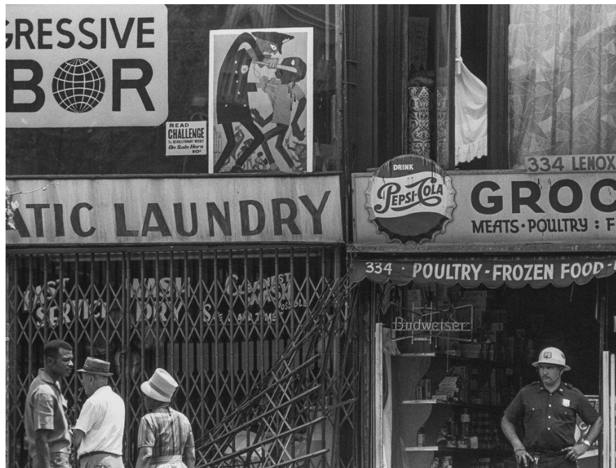
Roy DeCarava Progressive Labor, 1964

Roy DeCarava was born in New York City's Harlem neighborhood in 1919. He came of age during the Harlem Renaissance, when artistic activity and achievement among African Americans flourished across the literary, musical, dramatic, and visual arts. DeCarava began using photography as his art medium in the late 1940s, after working in painting and printmaking for the posters division of the Works Progress Administration (WPA) during the Great Depression in the 1930s. He used his camera to produce striking studies of everyday Black life in Harlem, capturing the varied textures of the neighborhood and the essence of the Harlem Renaissance.