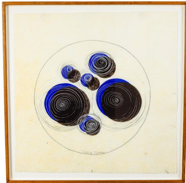
Toshiko Takaezu Untitled, ca. 1980 Color lithograph 22 1/2 x 28 1/2 inches Racine Art Museum, the Karen Johnson Boyd Collection

Toshiko Takaezu (1922 – 2011) took inspiration from nature and the environment around her to create art using various materials. While well-known for her work in ceramics, Takaezu also created paintings, prints, fiber, and cast bronze work. RAM's permanent collection has over 30 of Takaezu's pieces spanning the range of her artistic career. This in-depth collection reflects the ways in which the artist used color and shape across media to create a cohesive body of work. Take inspiration from the color, shapes, and patterns in Takaezu's lithograph below to create an original, layered circle drawing!