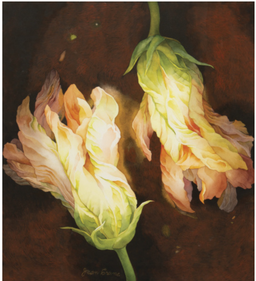
(opposite) Karen Brittain Found , 2018 Acrylic