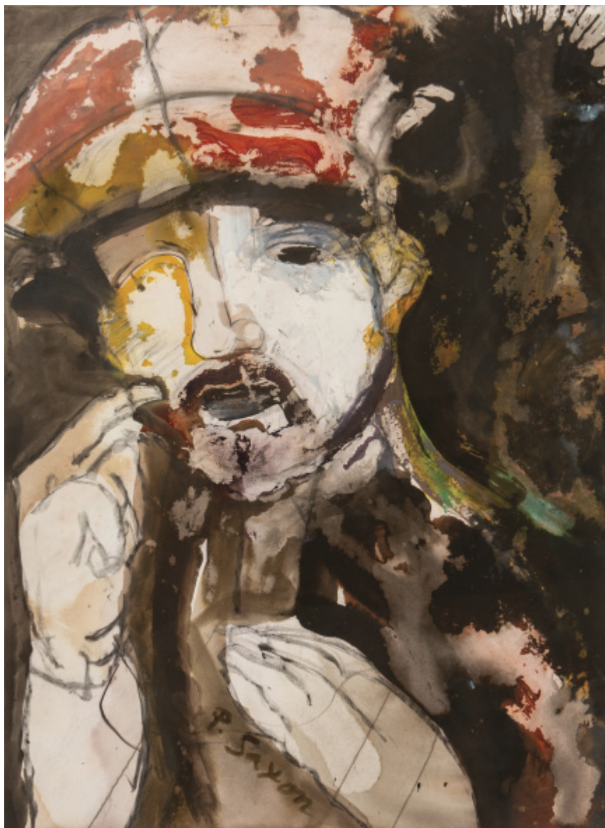
Phil Saxon Benediction , 2017 Ink and acrylic