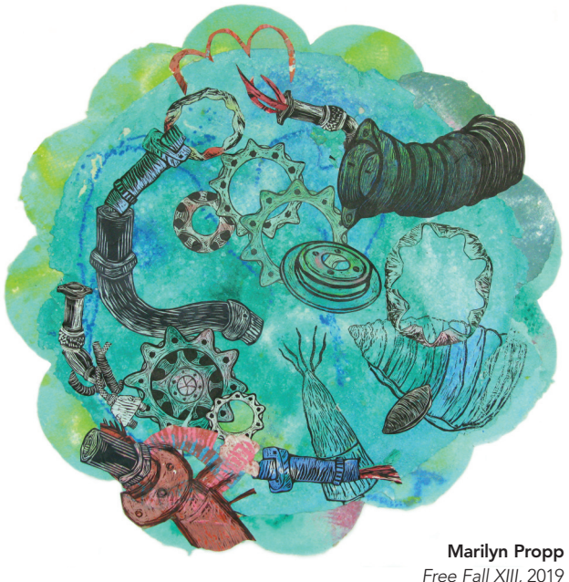
Free Fall XIII, 2019 Relief print, pigmented pulp, and collage on handmade cotton paper