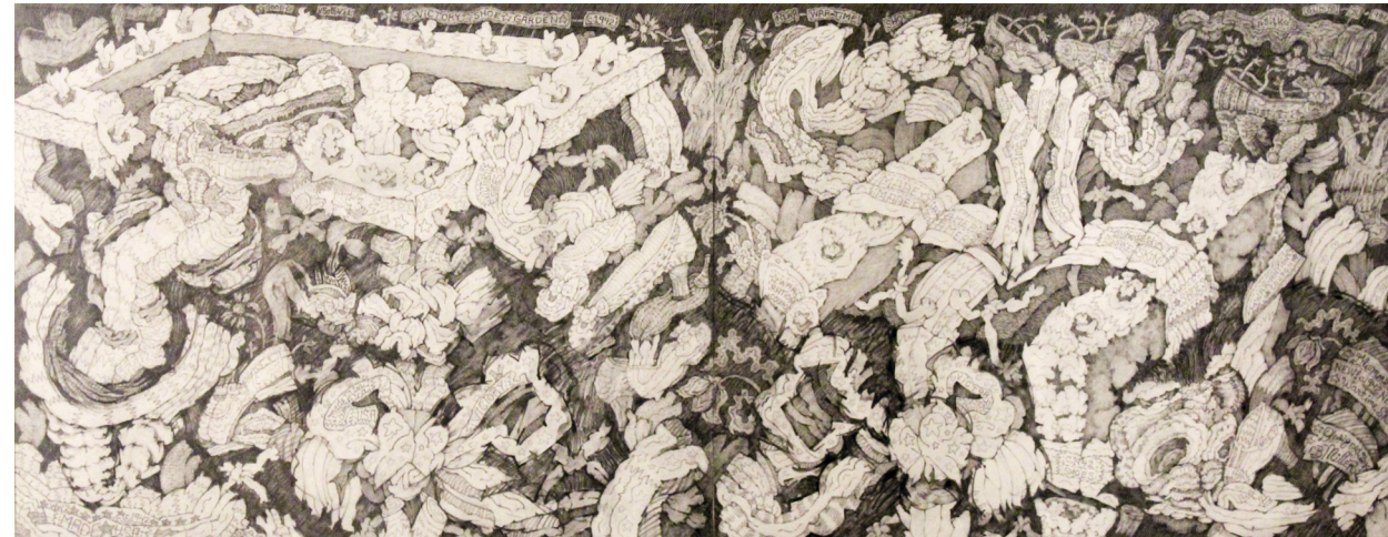
Harold Solberg Elm Flare , 2019 Elm