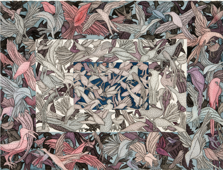
(opposite) Doug DeVinny Jim's Dream #2 , 2019 Watercolor on woodcut