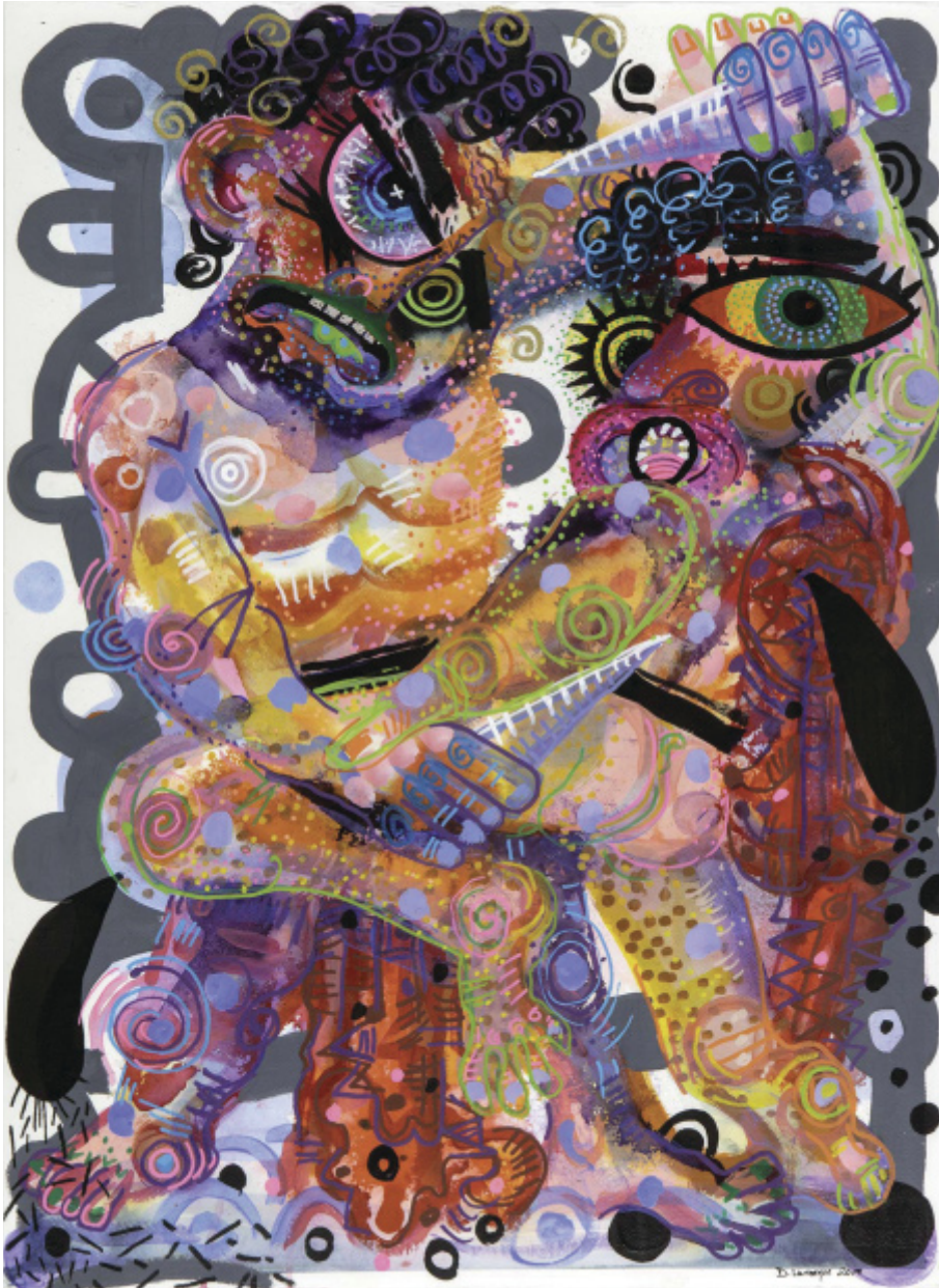
Diane Levesque The Grapplers , 2019 Watercolor and acrylic

RAM's Wustum Museum of Fine Arts 2519 Northwestern Avenue Racine, WI 53404 262.636.9177 ramart.org