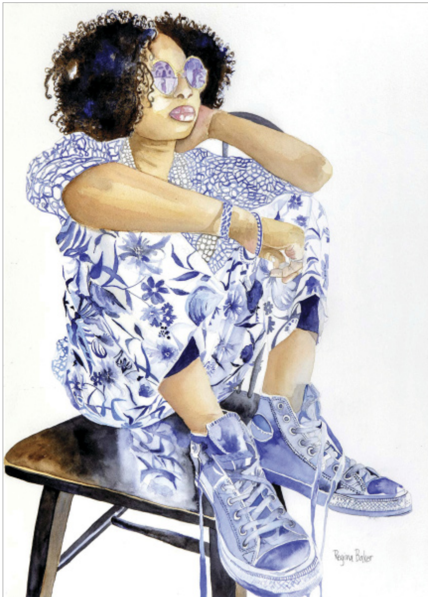
Regina Baker Blue Shoes, 2020 Watercolor

Jimmy Yanny Burlington Head Iguana, 2020 Watercolor NFS