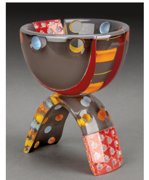
(below) Concetta Mason Instant Recall , 1985 Glass 8 x 6 3/4 inches diameter Racine Art Museum, Gift of George and Dorothy Saxe

RAM Racine Art Museum 441 Main Street Racine, Wisconsin 262.638.8300 ramart.org