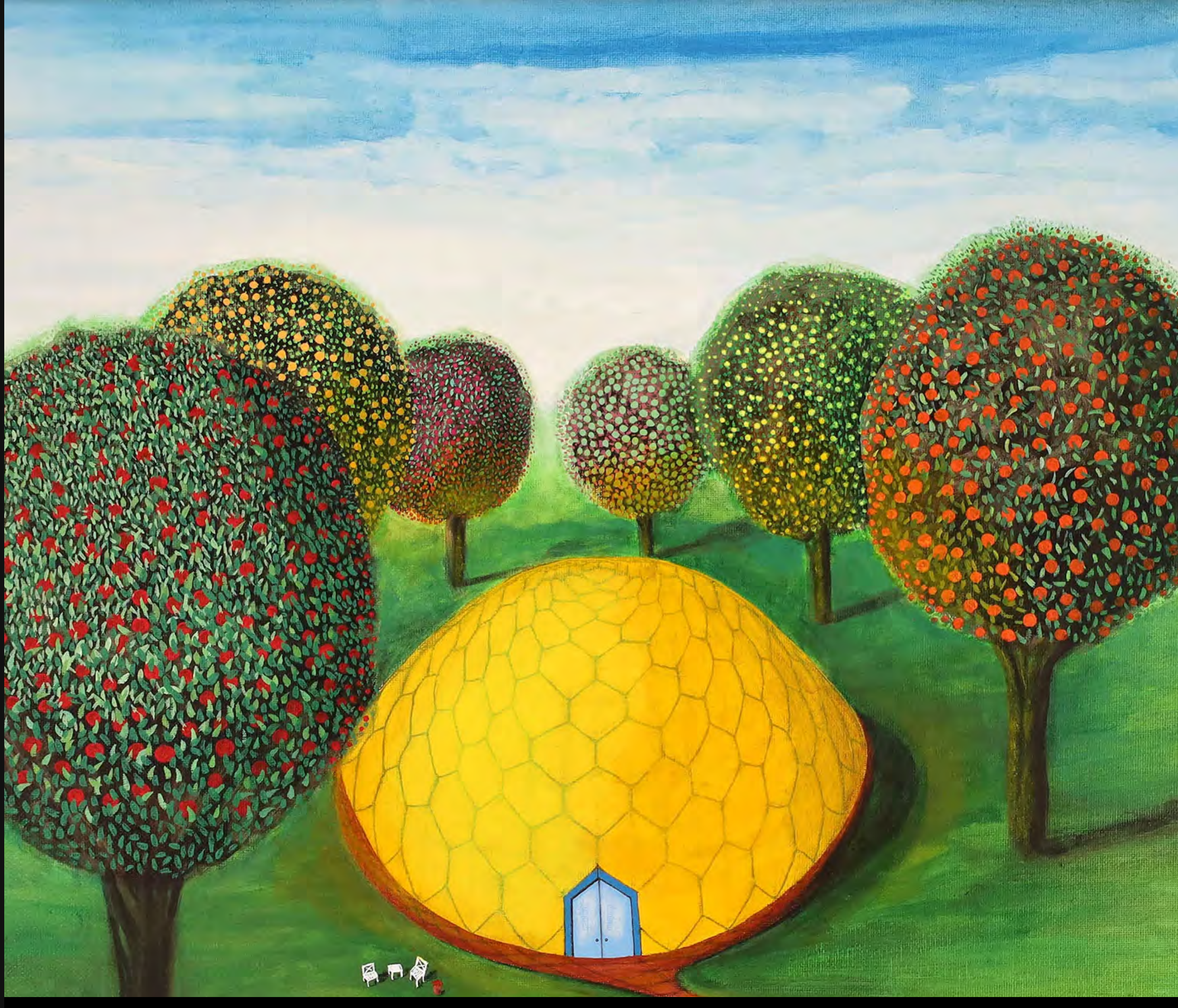
Eileen Black | Welcome Home | 2023 | Acrylic paint | Photography: Tyler Potter – Credit: RAM

Facebook, Twitter, YouTube, Instagram icons