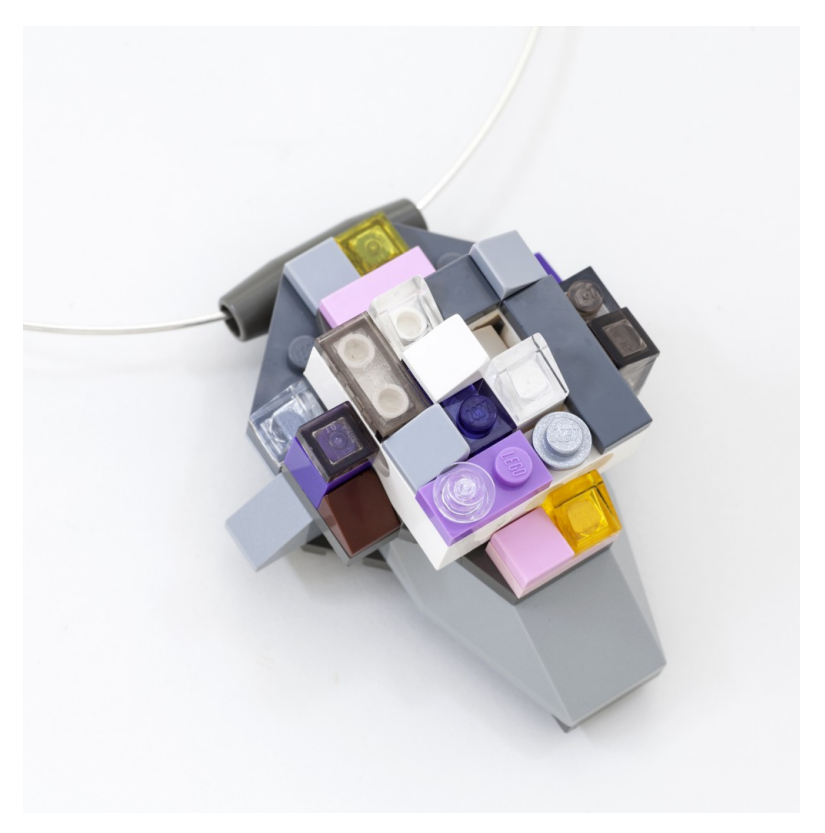
Lilac Voyageur Pendant:repurposed LEGO®, Argentium silver, strung on sterling silver neck cable

San Francisco-based emiko is best known for her inventive found object-based jewelry line (called emiko-o Reware) that frequently uses new and used LEGO® bricks. The jewelry is fresh, vibrant, dramatic, and instantly memorable.