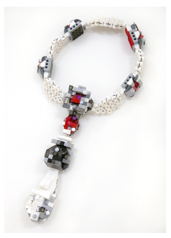
La Reine necklace, repurposed & recycled LEGO®, Argentium silver, coated copper wire, coated steel cable

She hails originally from Cleveland, the daughter of a Japanese-American father and Caucasian mom with firm roots in the Midwest. A maker from the start, as a kid she played with things she found around her house ("including my mom's nylons"), and then, naturally gravitated toward studying art at Syracuse, where she focused on metalsmithing and fashion and costume design. (Now that's a combination.)