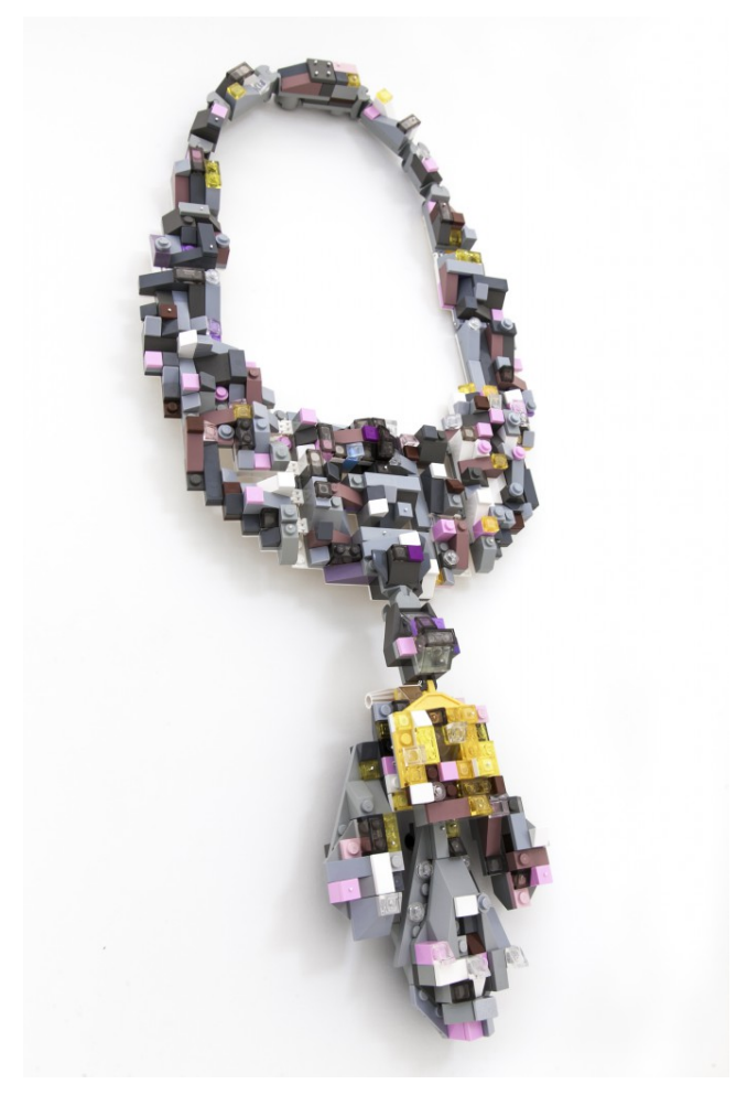
La Ceremonie, recycled and repurposed LEGO®, Argentium and sterling silver, fine silver tag