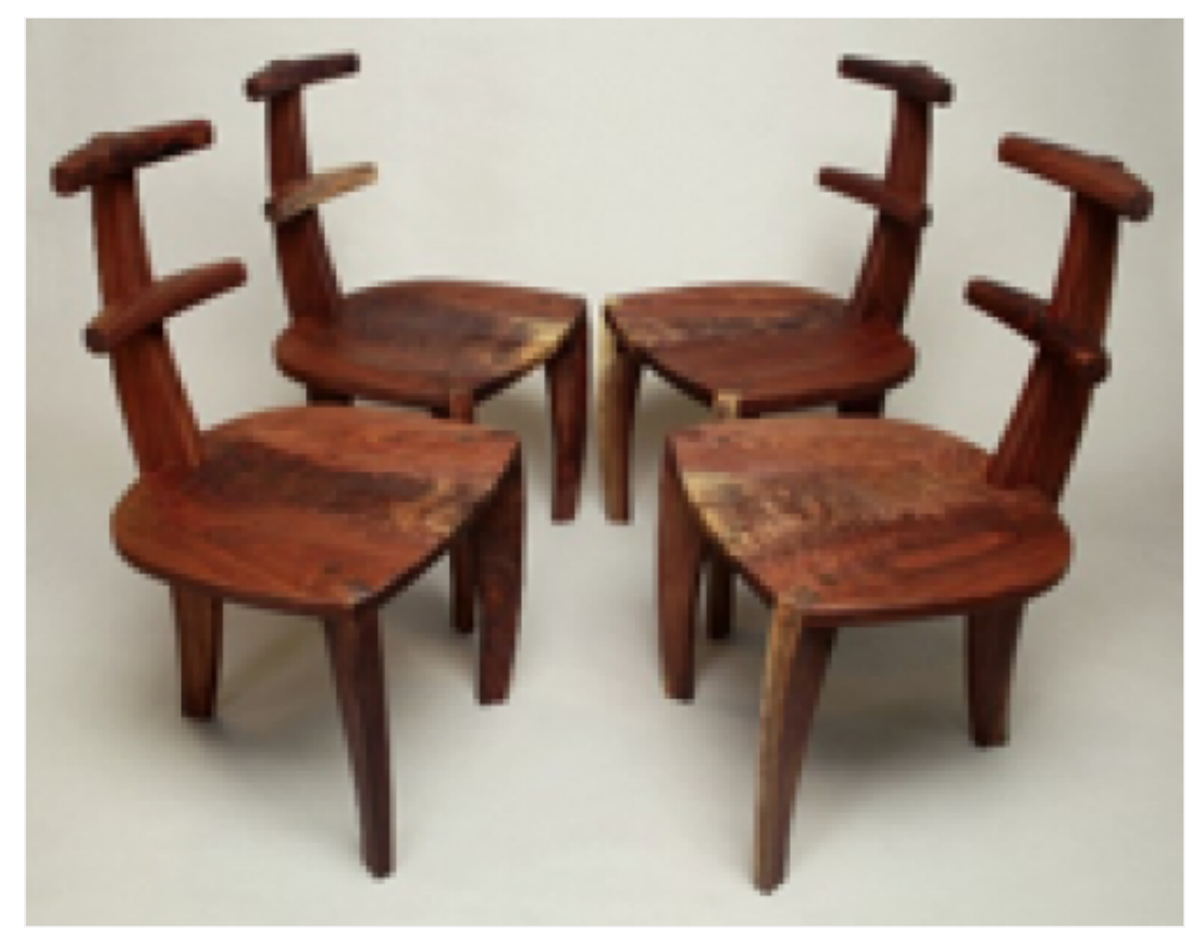
Robert "Andrew" Black Walnut Chairs, 2014 Walnut 36 x 22 x 22 inches Courtesy of the Artist

Offering an expansive lens for understanding material use and value, this exhibition reflects regional artists and designers applying their individual styles and personal interests to this oftendiscarded wood. Aligning with its contemporary crafts focus, RAM is the first museum to feature this annual event, which also showcases area talent. It is presented in conjunction with Wisconsin Urban Wood, a non-profit organization that is developing partnerships that allow urban wood to be recognized as a valuable resource.