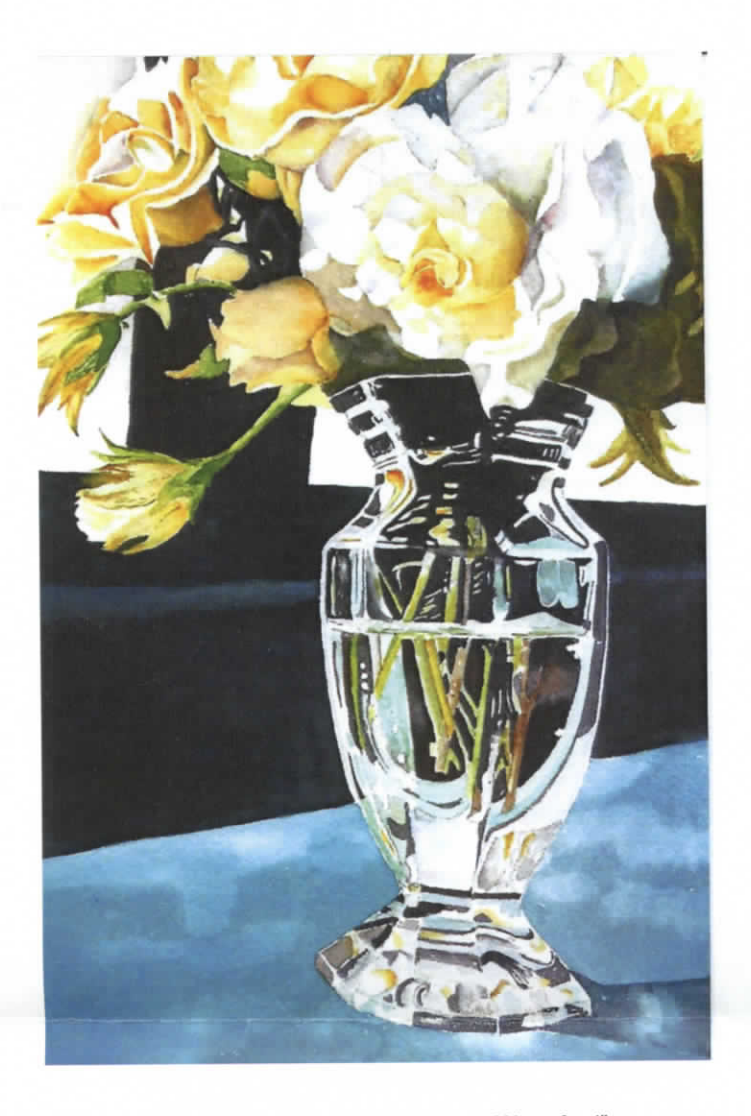
Karen Finerty, "Yellow Roses in Waterford"