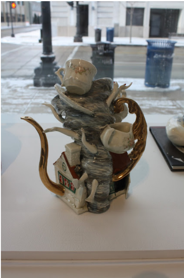
Swept up in a hurricane teapot!

We enjoyed viewing the vases. My husband, daughter and I had incredibly different opinions on which were our favorites. Viewing an art museum with others really can open up your mind when you discuss what appeals to you and why. There truly are many ways to looking at everything!