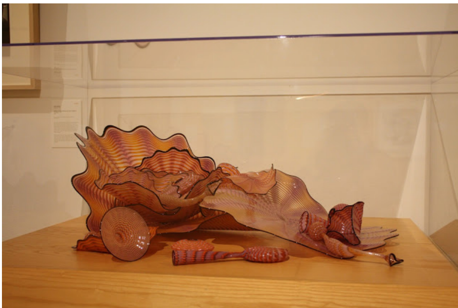
Dale Chihuly glass art

During our visit, we explored an exhibit celebrating the 75th anniversary of the RAM's parent museum, the Charles A. Wustrum Museum of Fine Arts. The pieces were chosen to show the expansion of the collection as well as tell a story beyond the art itself. Immediately when we entered the gallery, we noticed a Chihuly. This is such a fabulous example that museums of all sizes are home to incredible treasures. You never know what you will find while exploring!