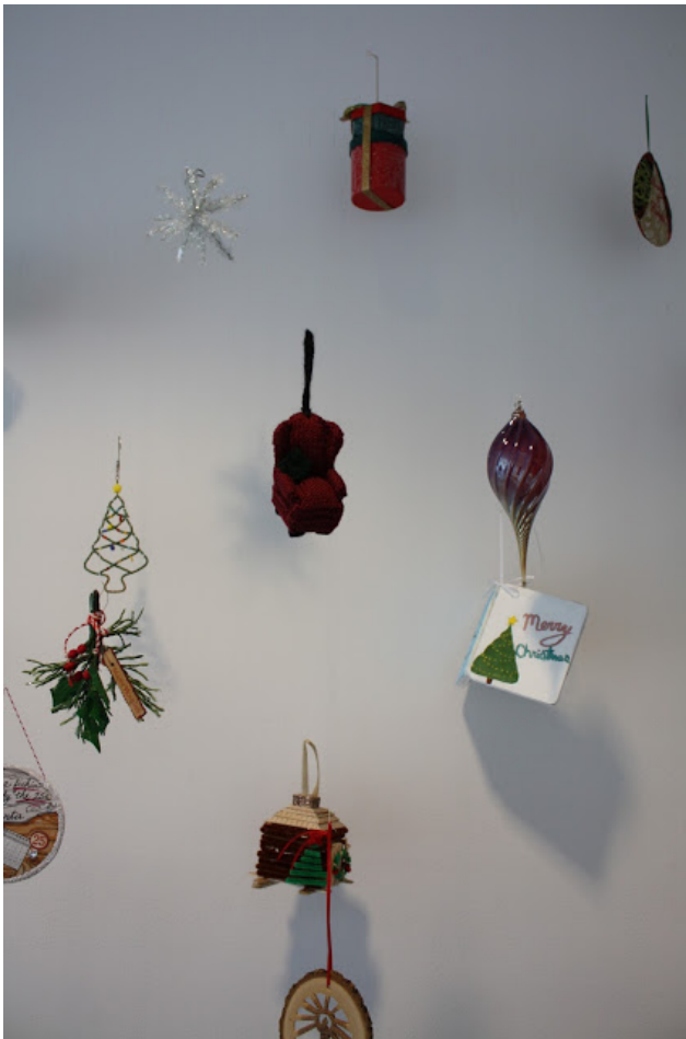
Ornaments from RAM's community contest.

The RAM does seem to change its exhibitions quite regularly. So, there will always be something new during each visit! The museum features quite a few American artists including local artists and artists from the region. The gift shop is also a treasure and does include made in USA artwork and other items made in the USA. Racine is also home to several art galleries. My favorite, Northern Lights Gallery , is right up the street from the museum. While in the area, also visit Mocha Lisa for a coffee and more art! So, a visit can easily become quite a day of art exploration. Gray days can be tough, but art really puts the sunlight and inspiration in!