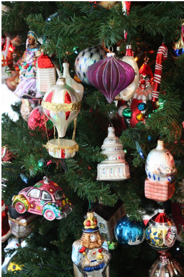
Truly a glass ornament for everything including a balloon! The first gallery was home to quite a few vessels including some visitor favorite teapots from the RAM's collection of 250. My favorite -- the Pileated Woodpecker. Stunning!