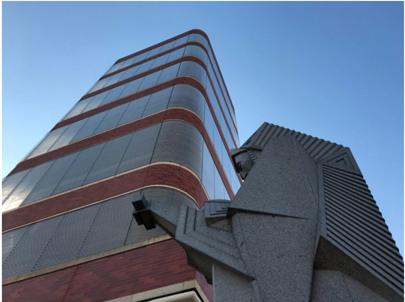
The research tower.

While this world-class Frank Lloyd Wright complex has temporarily paused its on-site tours due to coronavirus, you can still see the stunning exterior of the main building and the research tower. Also on the campus and visible from the street is the Sir Norman Foster-designed Fortaleza Hall.