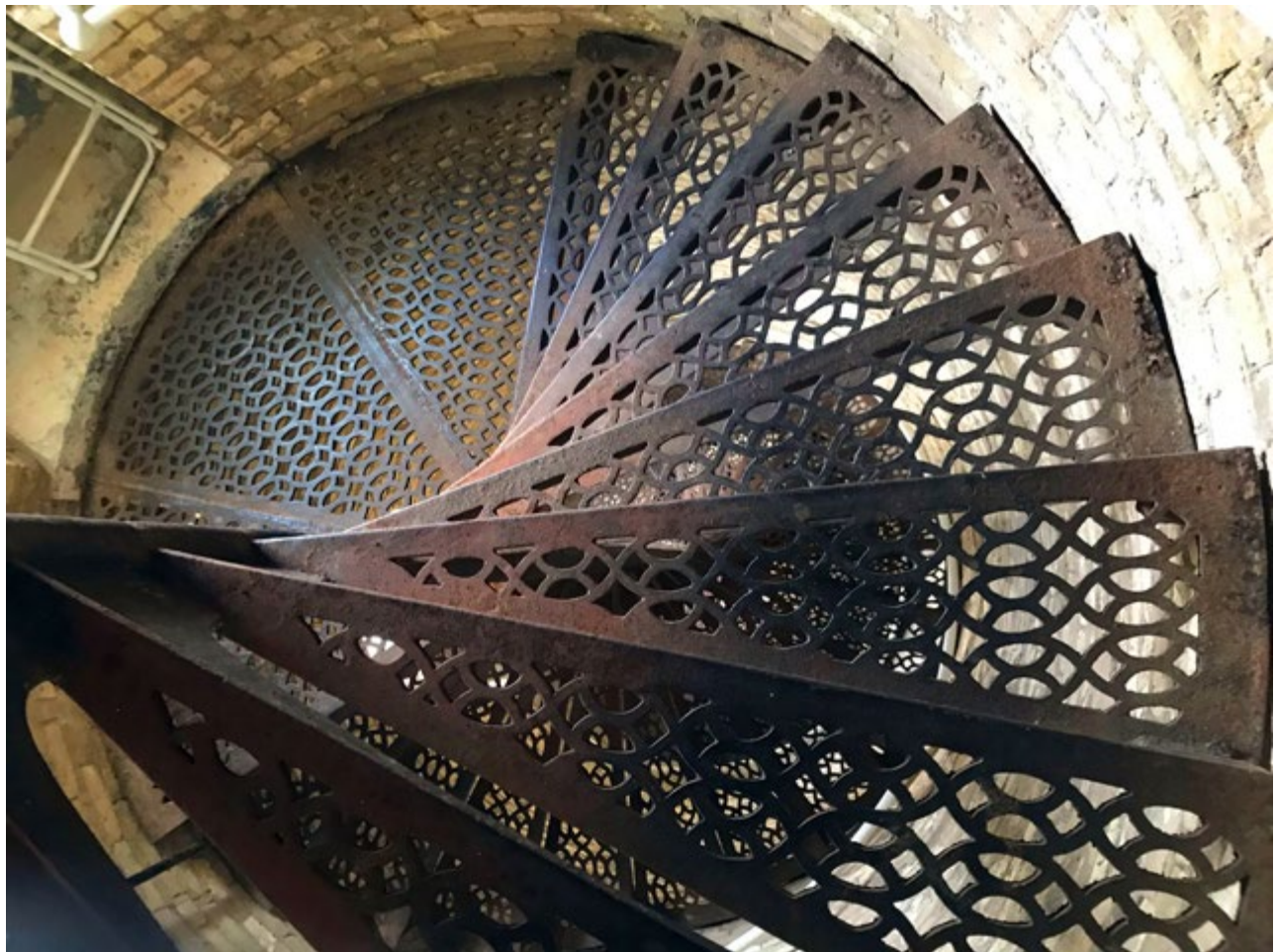
The stairs to the top.

Built in 1880, the 108-foot Wind Point lighthouse is one of the tallest, but also one of the oldest still-active lights on the Great Lakes. This beautiful lighthouse – which was listed on the National Register of Historic Places in 1984 – is open seasonally for regular tours, but groups can also arrange tours in the off-season. Details are at the lighthouse web site, or by calling (262) 639-3777. Read more about the lighthouse and its history in this Urban Spelunking story .