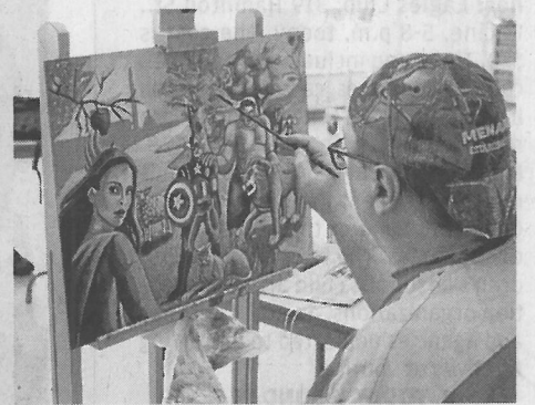
An artist works on a painting at a RAM painter's studio.

To make an appointment, go to wihumane.org . For more information, call 262-554-6699.