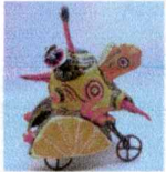
Bill Reid's work, "Beehicle," is painted steel completed in 2022.