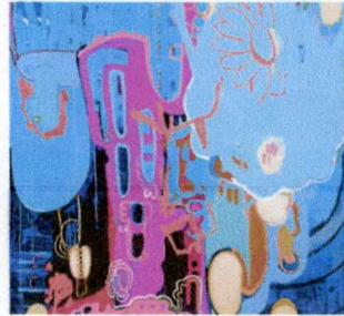
HOTEL VERDANT PERMANENT ART COLLECTION