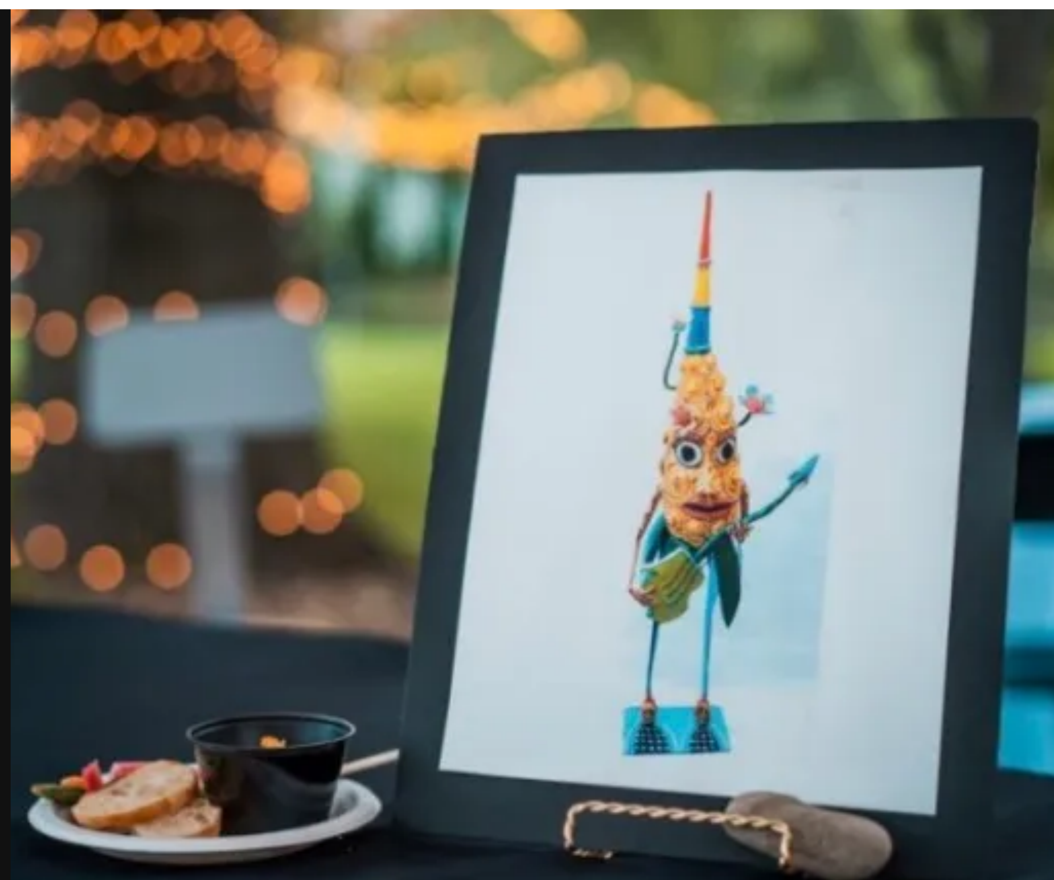
SAVOUR 2022 – Photography: Lori Potrykus